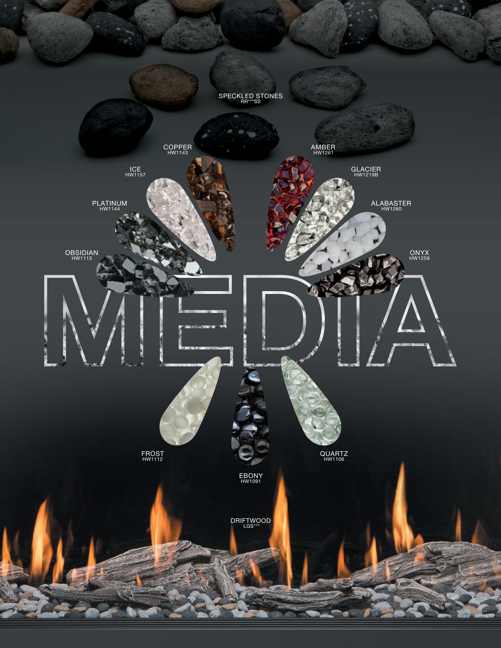
SPECKLED STONES RR***SS